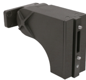
PT-AL1-A-SPM Adjustable Mount For Square Pole