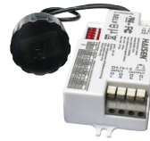
PT-A-MSA-D Microwave motion sensor