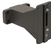
PT-AL1-A-SAM Straight Arm Mount for Square Pole