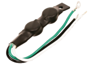
PT-A-SP Surge Protector