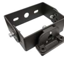
PT-ALT-A-TM Trunnion Mount