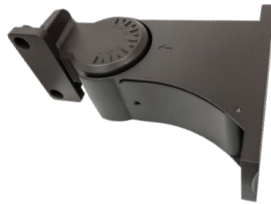
PT-ALT-A-SQM Square Mount