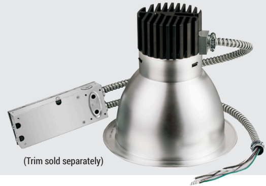
(Trim sold separately)

Ideal use for commercial complexes, hospitality, healthcare industry, schools, shopping centers, industrial areas and hotels.