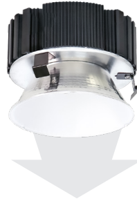
PT-CDL-40W One driver, different trim options