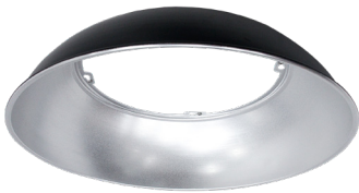
PT-HBT-RL-AL Aluminum Reflector for use with 200W and 240W HBT Round High bay (Dia: 23" x Height: 5.5")