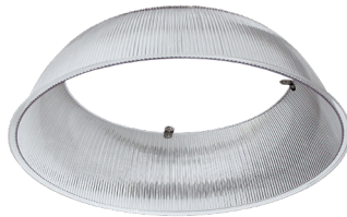
PT-HBT-RL-PC Polycarbonate Reflector or use with 200W and 240W HBT Round High bay (Dia: 18.75" x Height: 8")