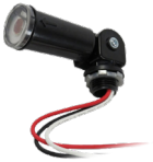
PT-A-PSA Adjustable Photocell