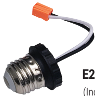
E26 Adapter (Included)