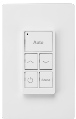
PT-5WS-BT-B Battery 5 Button Wall Switch