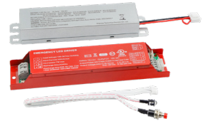
EM LED Emergency Driver