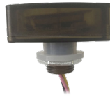
MS-WP3 Microwave Motion Sensor (100V-277V)