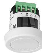
3-RF Athena Wireless Node (RF)