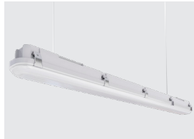
V-HOOK Suspended Mount