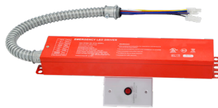
PT-EM1-15W LED Emergency Driver