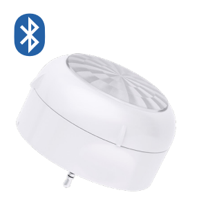
PT-MS-35-BT Bluetooth Audiojack Sensor