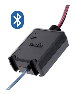
PT-BTC-EM Bluetooth EM Controller