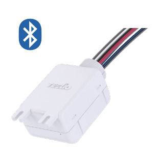
PT-BT-6 Bluetooth Fixture Sensor