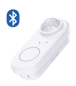
PT-MS-BT Bluetooth Motion Sensor