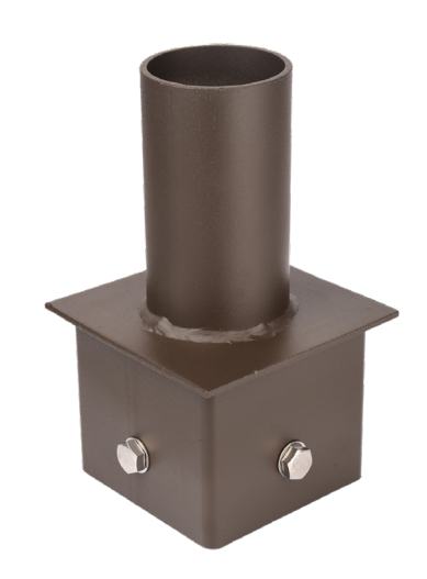
PLEASE NOTE: Actual color of product may vary in printing.