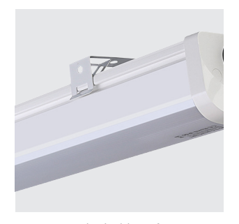
Comes standard with surface mounting kit