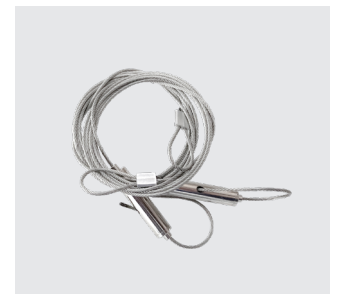
A-CBL Aircraft Cable (Chain or cable sold separate)