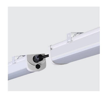
Continuous row mounting