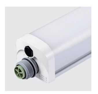
Pre-installed Emergency Battery Back-up option available