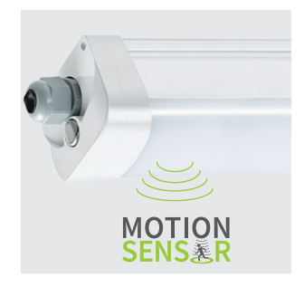
Pre-installed Motion Sensor option available