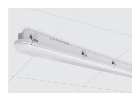
SM Surface mount