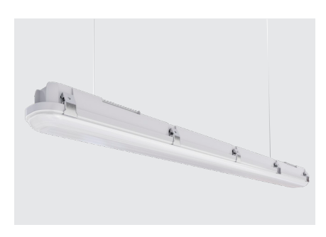
V-H00K Suspended Mount