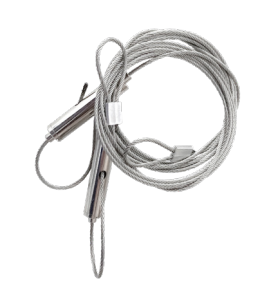
A-CBL 8' Aircraft Cable, V-Hook included