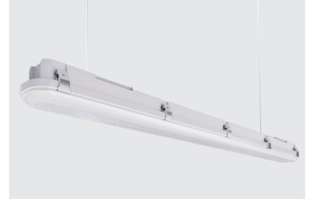
V-HOOK Suspended Mount