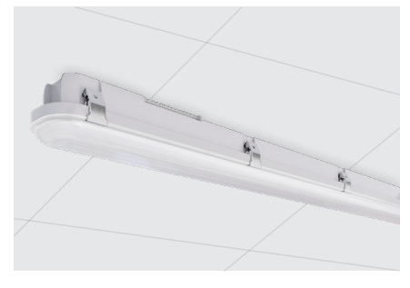
SM Surface mount