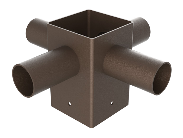
PLEASE NOTE: Actual color of product may vary in printing.