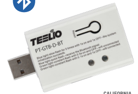
PT-GTB-D-BT Bluetooth Gateway Bridge USB-A Dongle