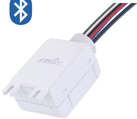
PT-BT-6 Bluetooth Fixture Sensor