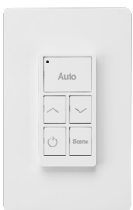
PT-5WS-BT-B Battery 5 Button Wall Switch