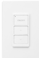
PT-3WS-BT-B Battery 3 Button Wall Switch