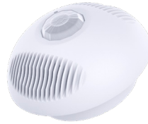
PT-MS-21-BT-JB Bluetooth Dual Tech Ceiling Sensor