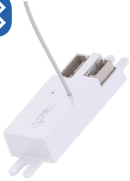
PT-BTN Bluetooth Node