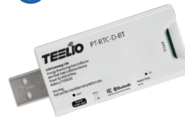
PT-RTC-D-BT Bluetooth Real Time Clock/ Energy Monitoring USB-A Dongle