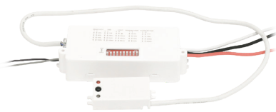
MS-MW Motion Sensor