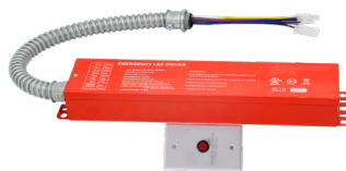
PT-EM1-15W LED Emergency Driver