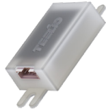
PT-A-EMS-MW Microwave Eco Sensor