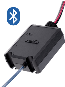
PT-BTC-EM Bluetooth EM Controller