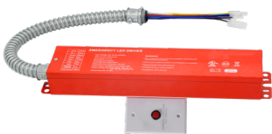
EM Low Voltage EM Battery