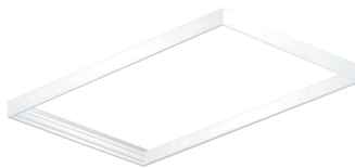
SMK-BLP-24 Surface mount kit for the 2x4 panel