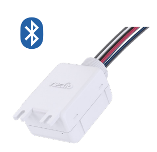
PT-BT-6 Bluetooth Fixture Sensor