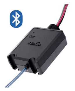
PT-BTC-EM Bluetooth EM Controller