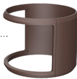
ABL-R-SHLD-180 Shield for PT-ABL-R series bollard