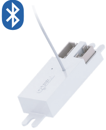
PT-BTN Bluetooth Node