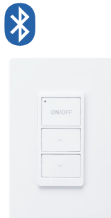
PT-3WS-BT-B Battery 3 Button Wall Switch