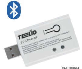
PT-GTB-D-BT Bluetooth Gateway Bridge USB-A Dongle