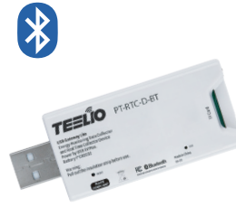
PT-RTC-D-BT Bluetooth Real Time Clock/ Energy Monitoring USB-A Dongle