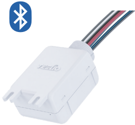
PT-BT-6 Bluetooth Fixture Sensor