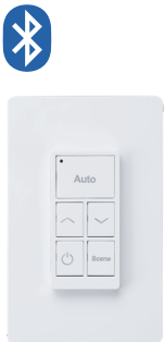
PT-5WS-BT-B Battery 5 Button Wall Switch