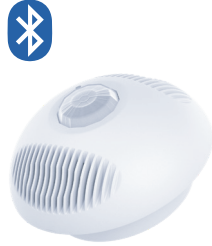
PT-MS-21-BT-JB Bluetooth Dual Tech Ceiling Sensor