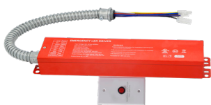
EM (PT-EMG-8W) Standard

PT-EMG-15W Low Voltage EM Battery (Additional cost)