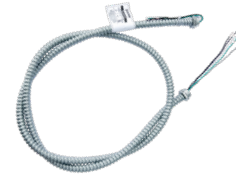
MC-5W-SC-6F / MC-6W-SC-6F (Screw-in) MC-5W-SN-6HD3F / MC-6W-SN-6HD3F (Snap-in) MC series metal flex whip