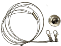
A-CB-BLP-224 5' Aircraft Cable