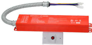
PT-EMG-8W / PT-EMG-15W Low Voltage EM Battery