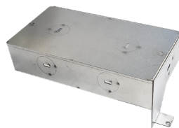
JB-BPL Junction box (Field installation)