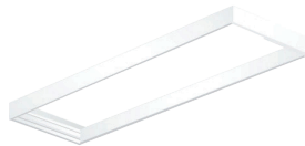
SMK-BLP-14 Surface mount kit for the 1x4 panel