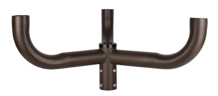
PLEASE NOTE: Actual color of product may vary in printing.