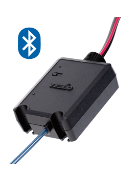
PT-BTC-EM Bluetooth EM Controller