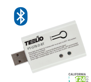
PT-GTB-D-BT Bluetooth Gateway Bridge USB-A Dongle