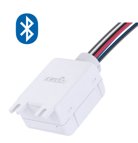
PT-BT-6 Bluetooth Fixture Sensor