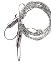
A-CBL 8' Aircraft Cable, V-Hook included