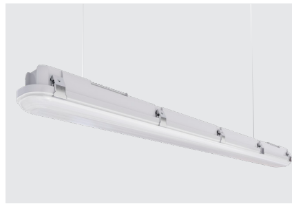
V-HOOK Suspended Mount