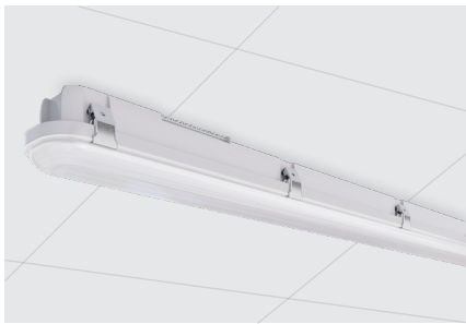
SM Surface mount