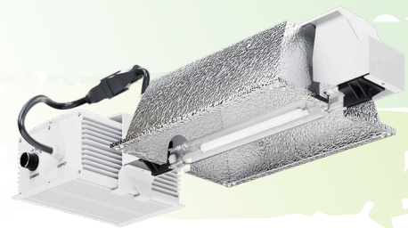
HPSPRO ® Series