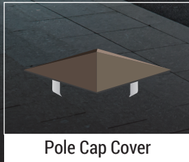
Pole Cap Cover