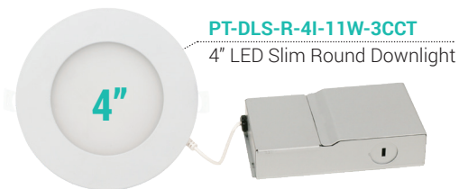
PT-DLS-R-4I-11W-3CCT 4" LED Slim Round Downlight