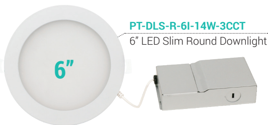
PT-DLS-R-6I-14W-3CCT 6" LED Slim Round Downlight