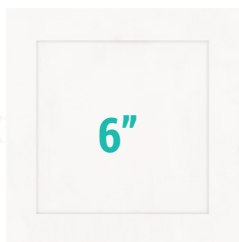
PT-DLS-S-6I-12W-3CCT 6" LED Slim Square Downlight