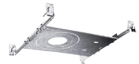
DLS-R-UNI 4"/6" Universal Slim LED Housing for New Construction