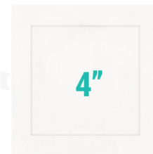
PT-DLS-S-4I-9W-3CCT 4" LED Slim Square Downlight