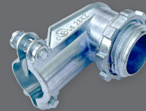
CON-90 90° adapter for use with MC product line