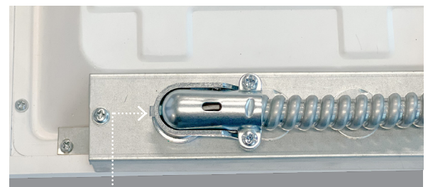
The flexi metal cable plus the CON-90 makes installation safe and secure.