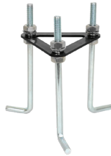
Anchor Bolt Require assembly (Included)