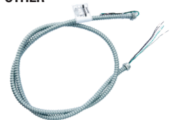
MC-5W-SC-6F / MC-6W-SC-6F (Screw-in) MC-5W-SN-6HD3F / MC-6W-SN-6HD3F (Snap-in) MC series metal flex whip