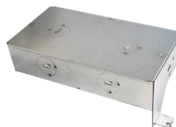
JB-BPL Junction box (Field installation)