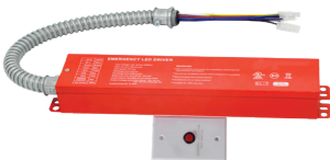
PT-EMG-8W / PT-EMG-15W Low Voltage EM Battery

vive Simple, scalable, wireless lighting control