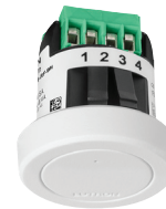
A-WN-D01-RF-WH Athena Wireless (RF) Node

vive Simple, scalable, wireless lighting control