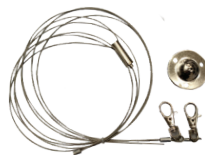
A-CB-BLP-224 5' Aircraft Cable