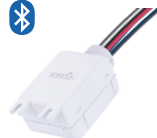
PT-BTC-6 6A Bluetooth Power Pack