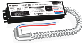
PT-SDT-325 325 VA Step Down Transformer (For PT-LHTL-185-2C3P)