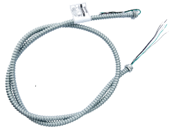
MC-5W-SC-6F / MC-6W-SC-6F (Screw-in) MC-5W-SN-HD-6F / MC-6W-SN-HD-6F (Snap-in) 6FT 5 Wire MC Whip / 6FT 6 Wire MC Whip