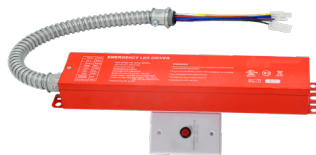
EM LED Emergency Driver