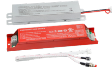
PT-EMN Series PT-EMN-08W (For 4ft) PT-EMN-15W (For 8ft)