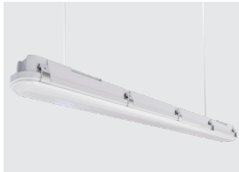
V-HOOK Suspended Mount