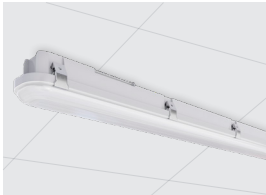
SM Surface mount