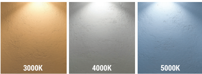
Easily flip the switch for desired CCT. It's that simple!