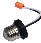
E26 Adapter included for easy retrofitting